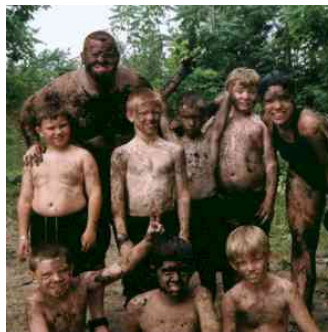
Lions Camp Fun!

Since its beginning in 1956, Wisconsin Lions Camp has been dedicated to providing a quality camping experience free-of-charge for students with disabilities. In addition, their Environment Education, Retreat and Conference Center and Teambuilding programs provide an opportunity for personal development in a safe, accessible environment.